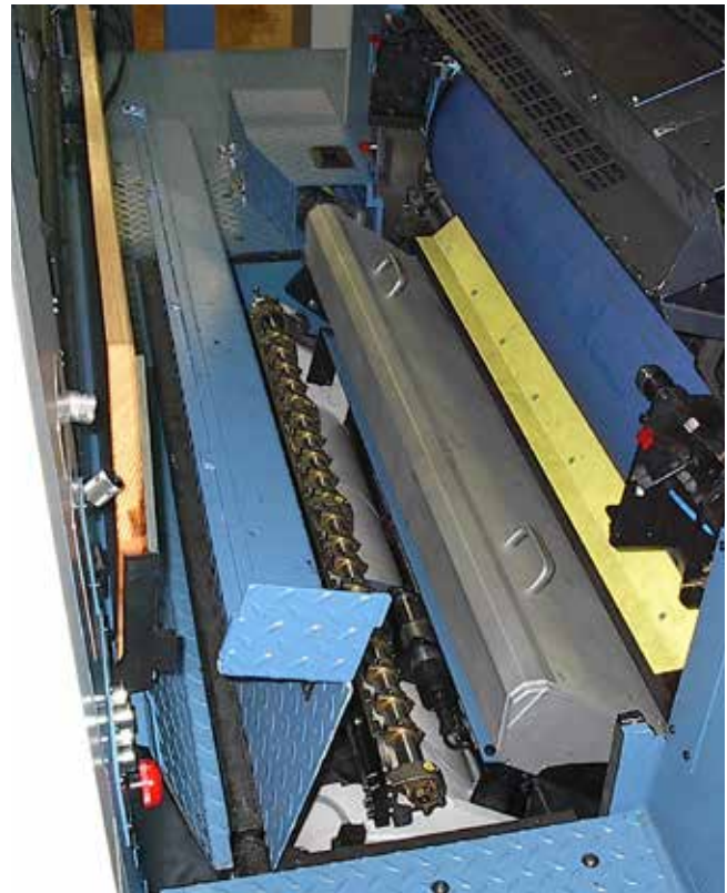
UV interdeck curing