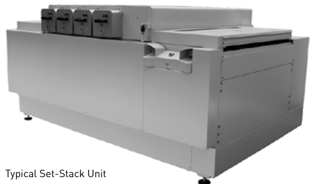
Typical Set-Stack Unit