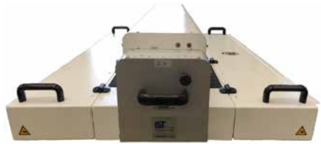
IST UV interdeck curing