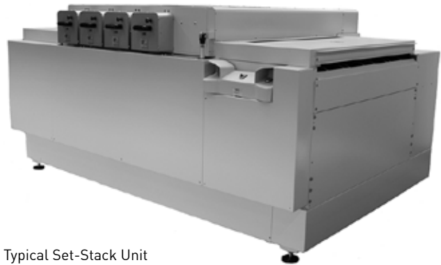
Typical Set-Stack Unit