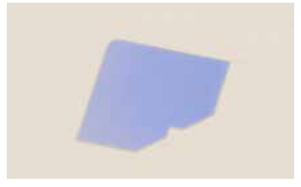
Irradiate the measuring strip with UV light; the measuring strip turns dark blue