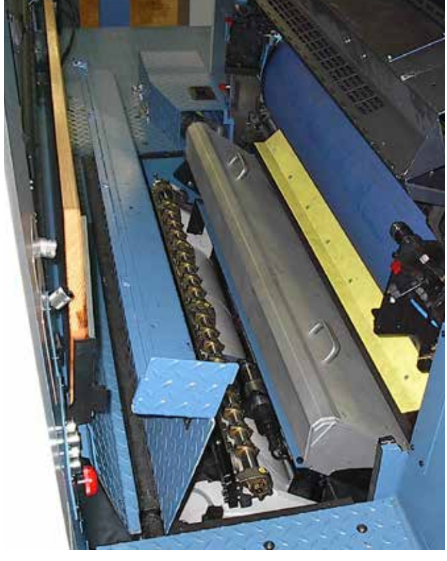
UV interdeck curing