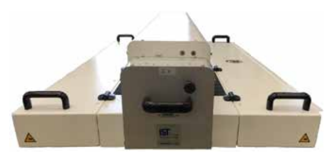
IST UV interdeck curing