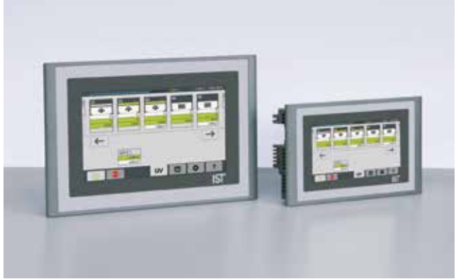
UV User Control Systems Smart Control