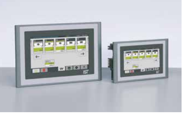
IST UV interdeck curing