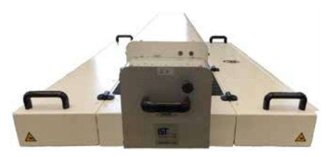
IST UV interdeck curing