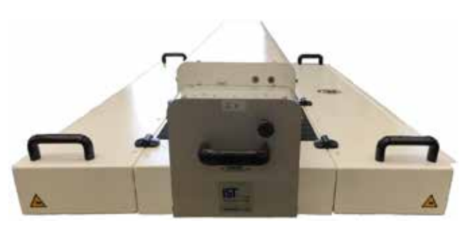
IST UV interdeck curing