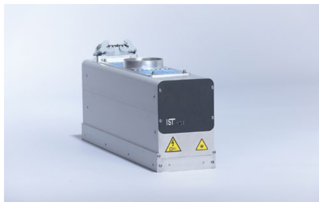
IST UV system MBS®-LI

Optimised air-flow and the use of a quartz-glass screen between lamp and substrate guarantees effective heatmanagement, allowing the MBS-LI UV system to be used with temperature-sensitive material.