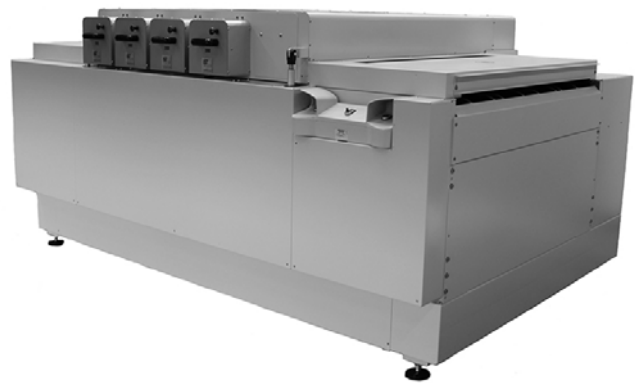
Typical Set-Stack Unit

Head Office: IST METZ GmbH, Lauterstrasse 14-18, 72622 Nuertingen, Germany, Tel.: +49 7022 6002-0, Fax: +49 7022 6002-76, info@ist-uv.com