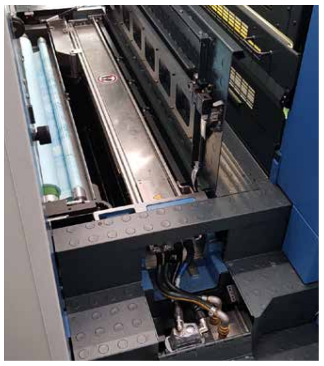
IST UV interdeck curing